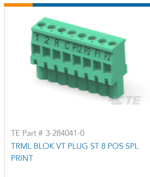
TE Part # 3-284041-0 TRML BLOK VT PLUG ST 8 POS SPL PRINT