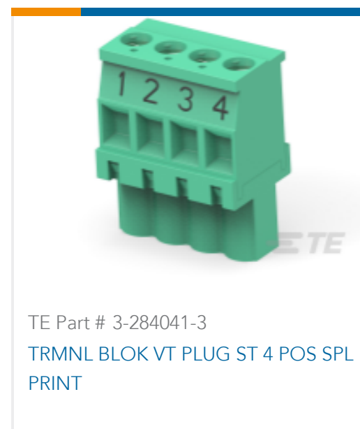
TE Part # 3-284041-3 TRMNL BLOK VT PLUG ST 4 POS SPL PRINT